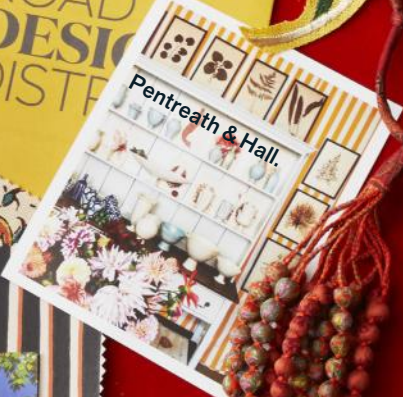
Pentreath & Hall.